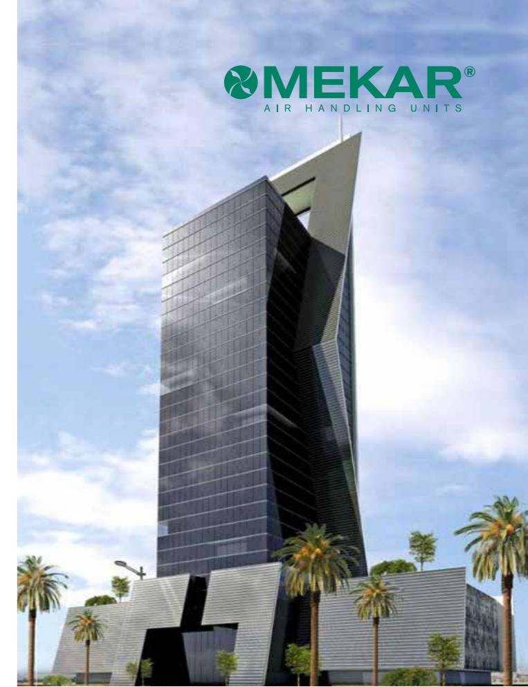
Burj Marina Qatar