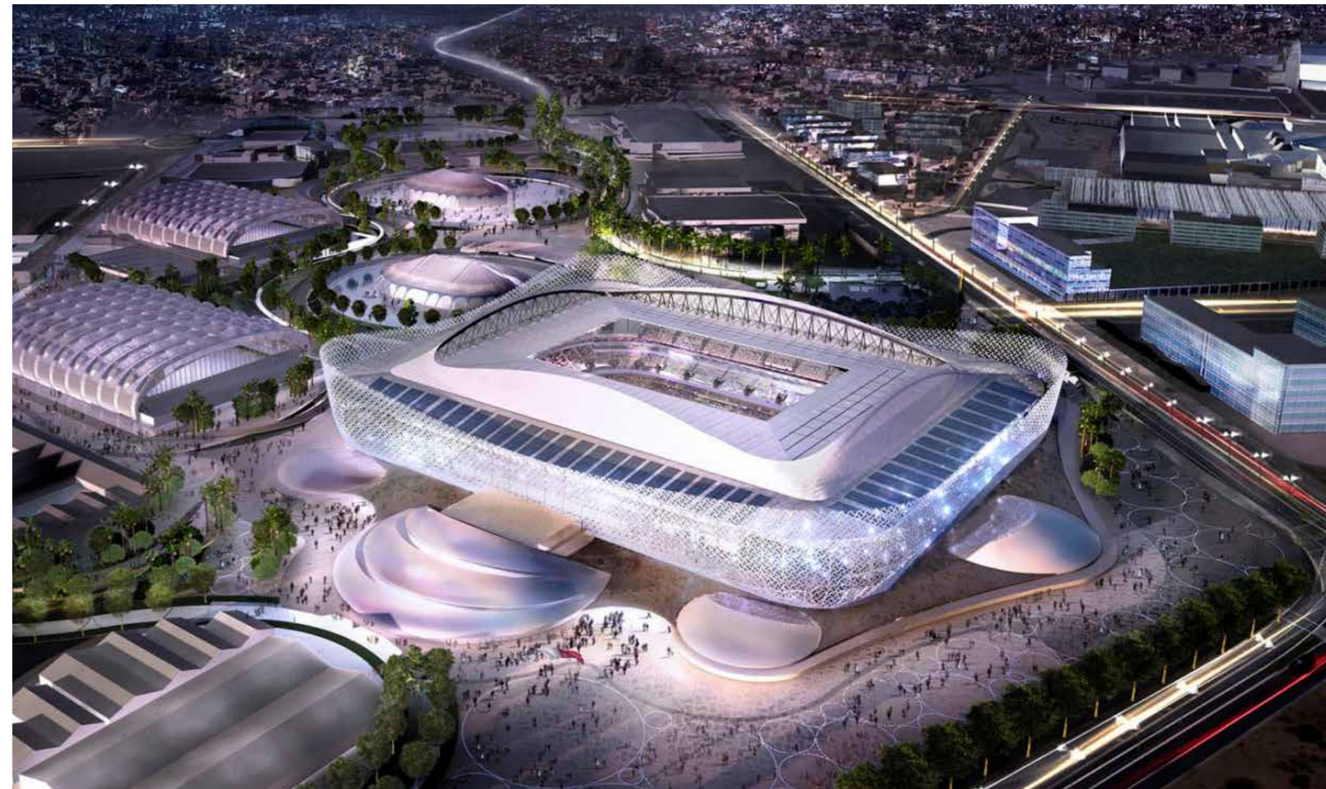
Al Rayyan Stadium - Qatar