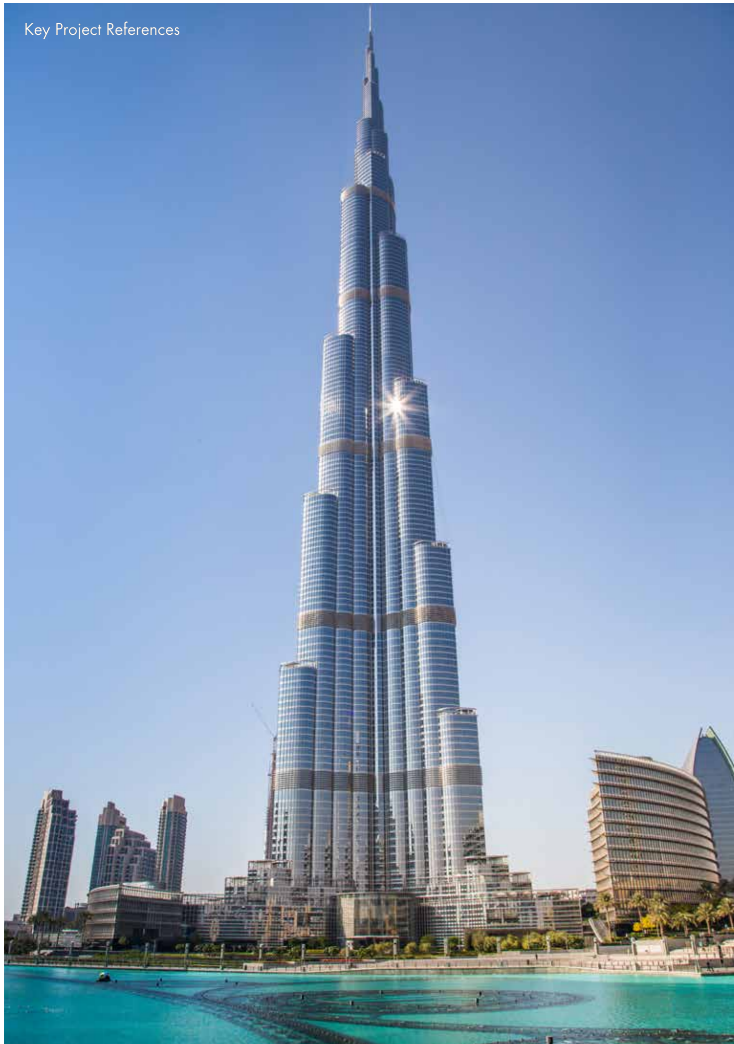
Burj Khalifa Dubai