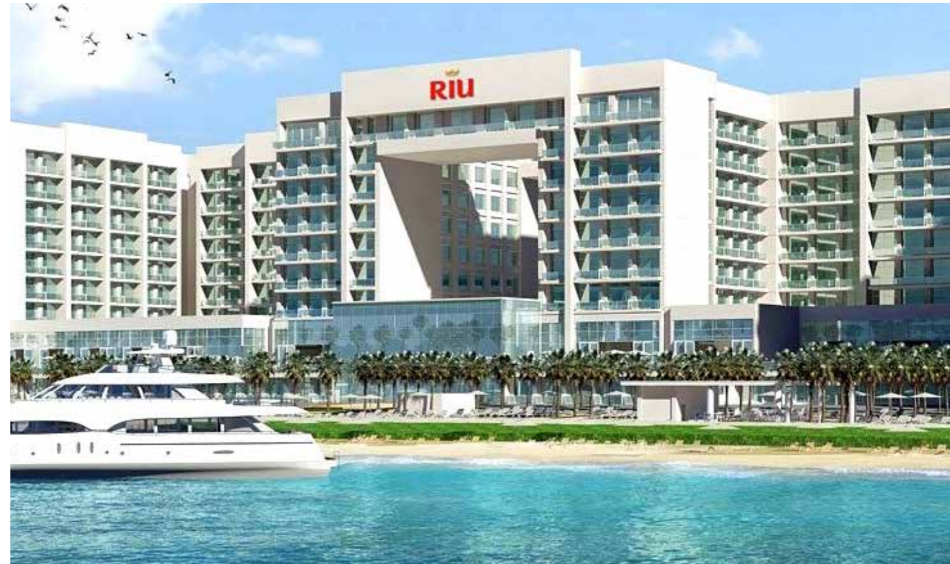
Riu Hotel - Palm Deira Dubai