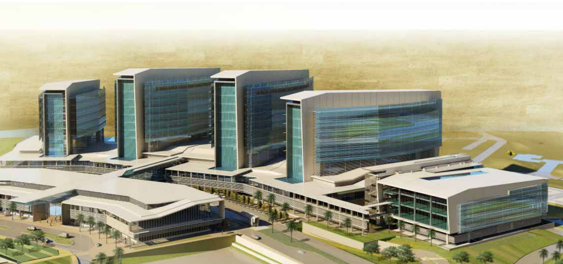
Mafraq Hospital Abu Dhabi