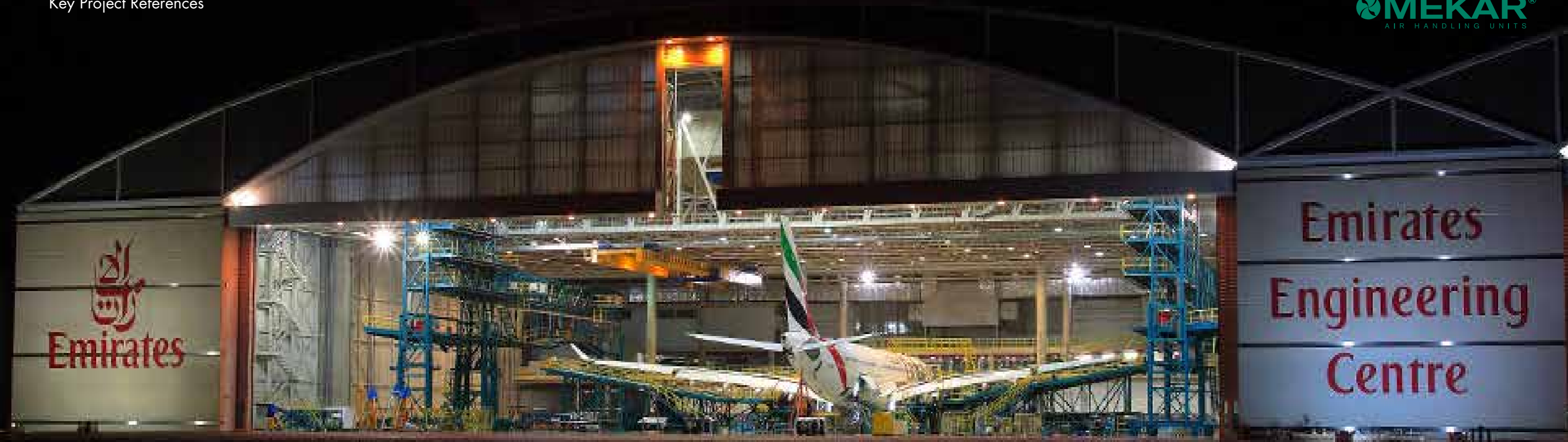
Emirates Hanger Dubai