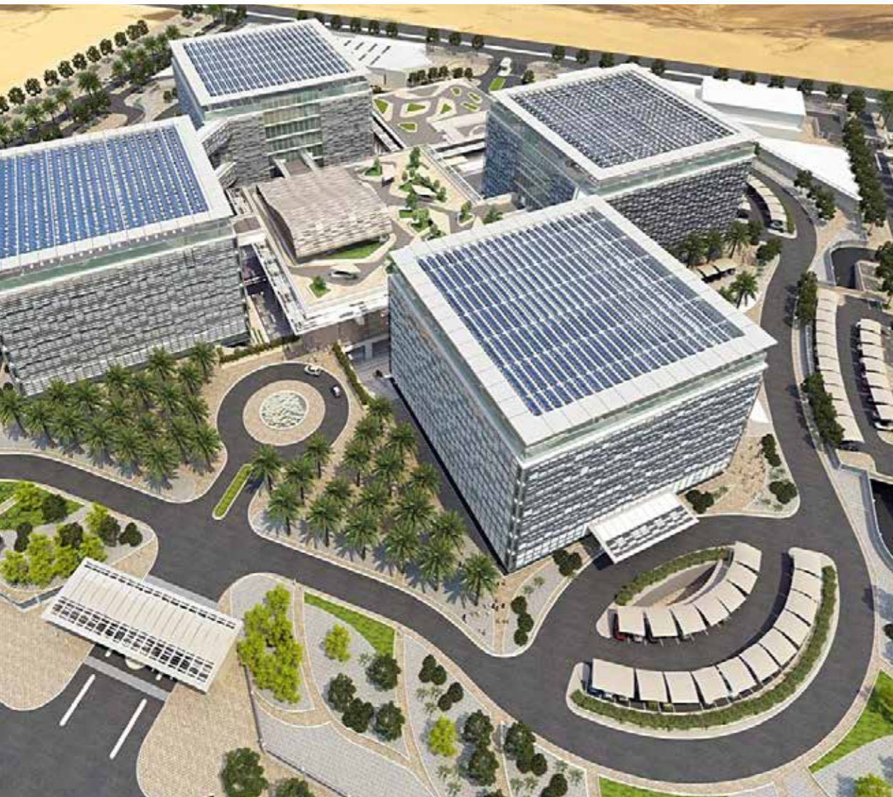
Saudi Electricity Company Headquarters KSA