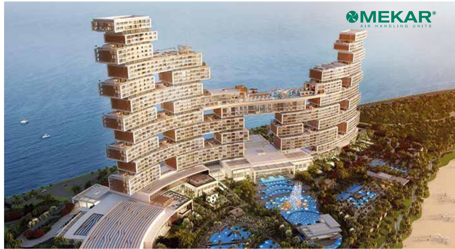
Royal Atlantis - Dubai