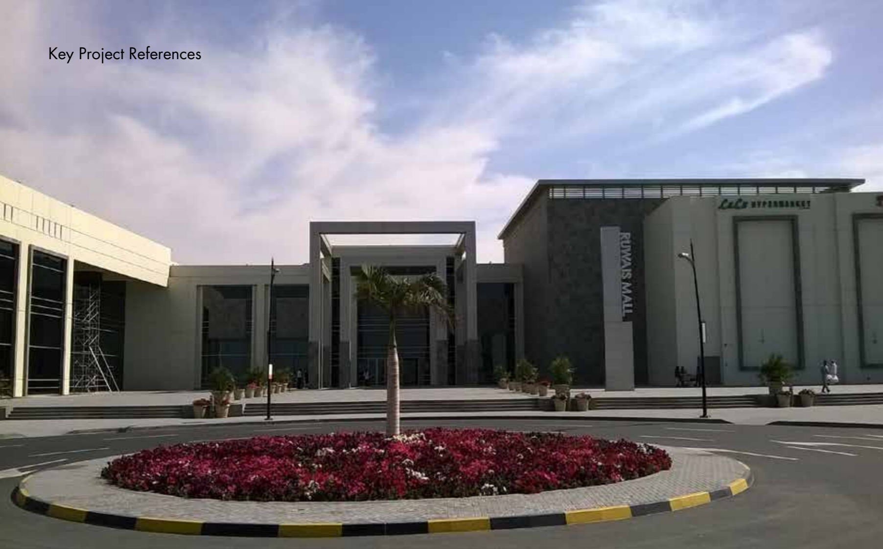
Ruwais Mall Abu Dhabi