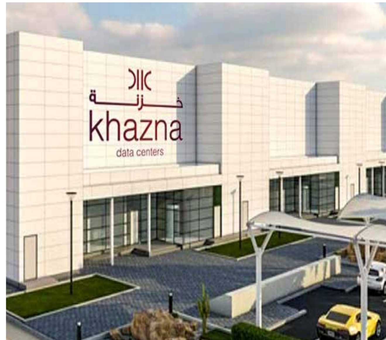
Khazna Data Center Dubai