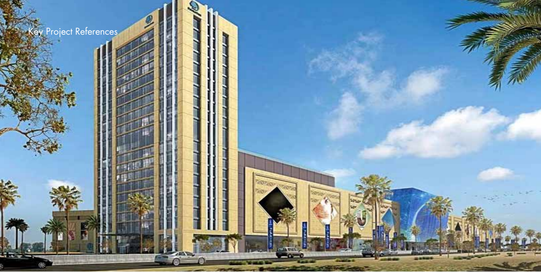
Al Khail Avenue Dubai