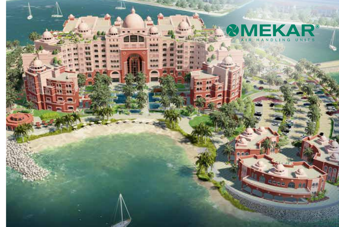
Marsa Malaz Hotel Qatar