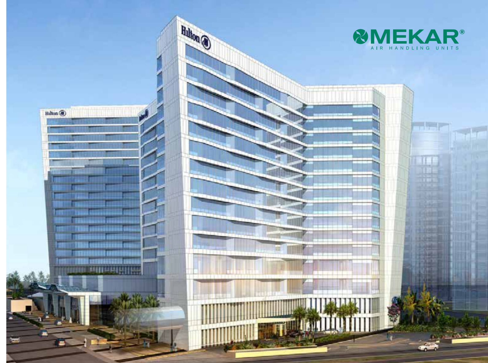
Hilton Riyadh KSA