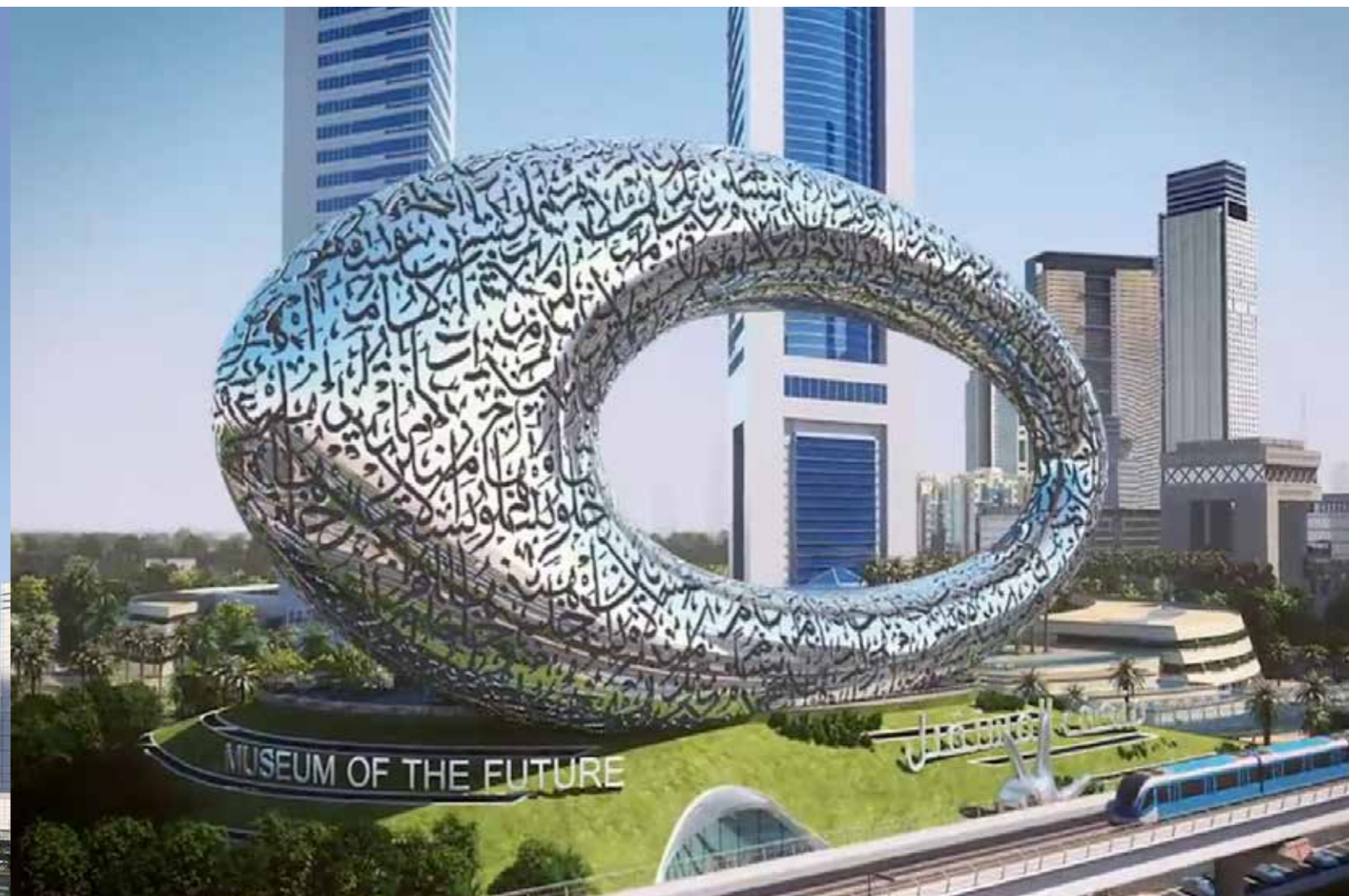
Museum of The Future Dubai