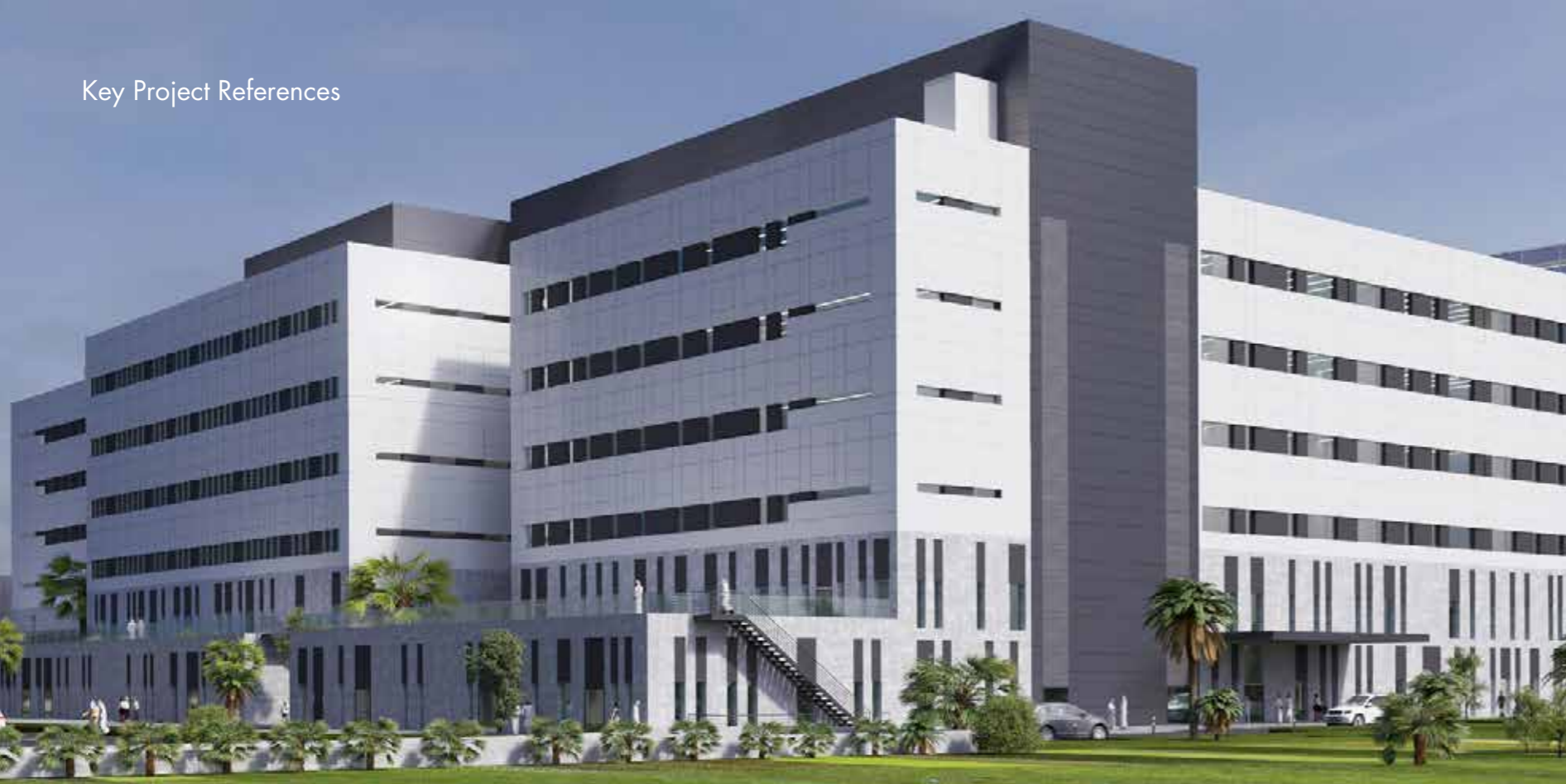
Hospital Infectious Diseases- Kuwait