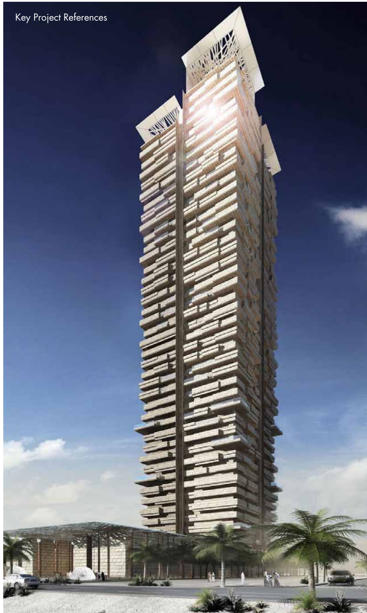
Burj Ramla - KSA