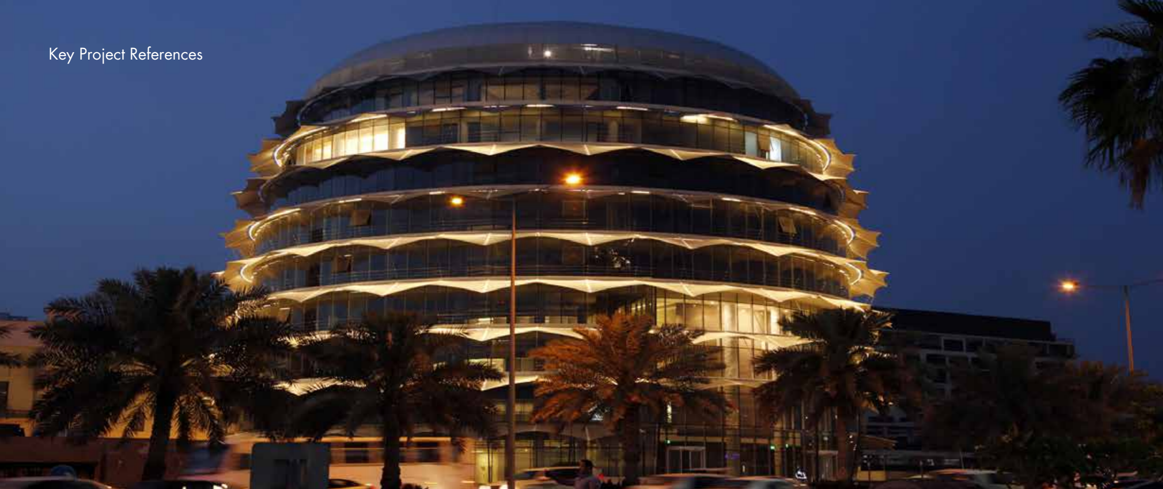
Bin Ghanem Office Building Qatar