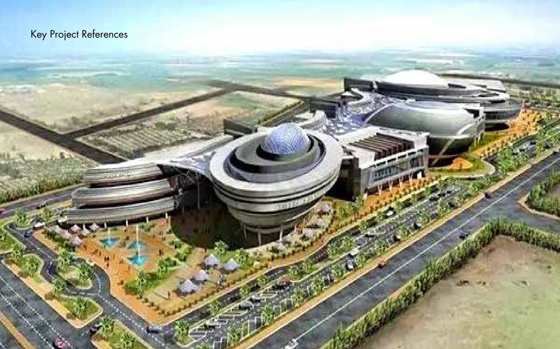
Boulevard Mall - Qatar