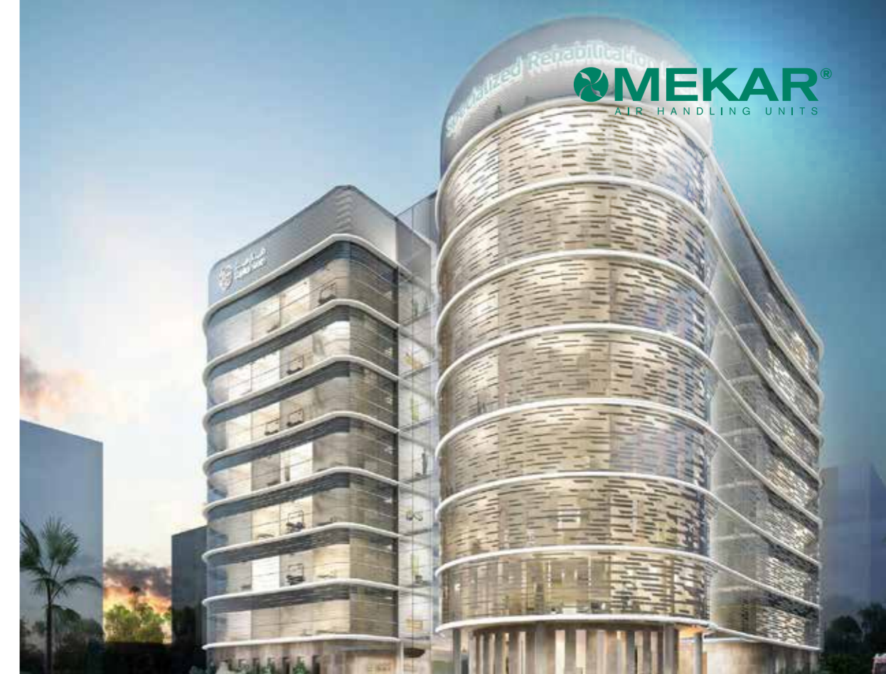
Specialist Rehabilitation Hospital Abu Dhabi