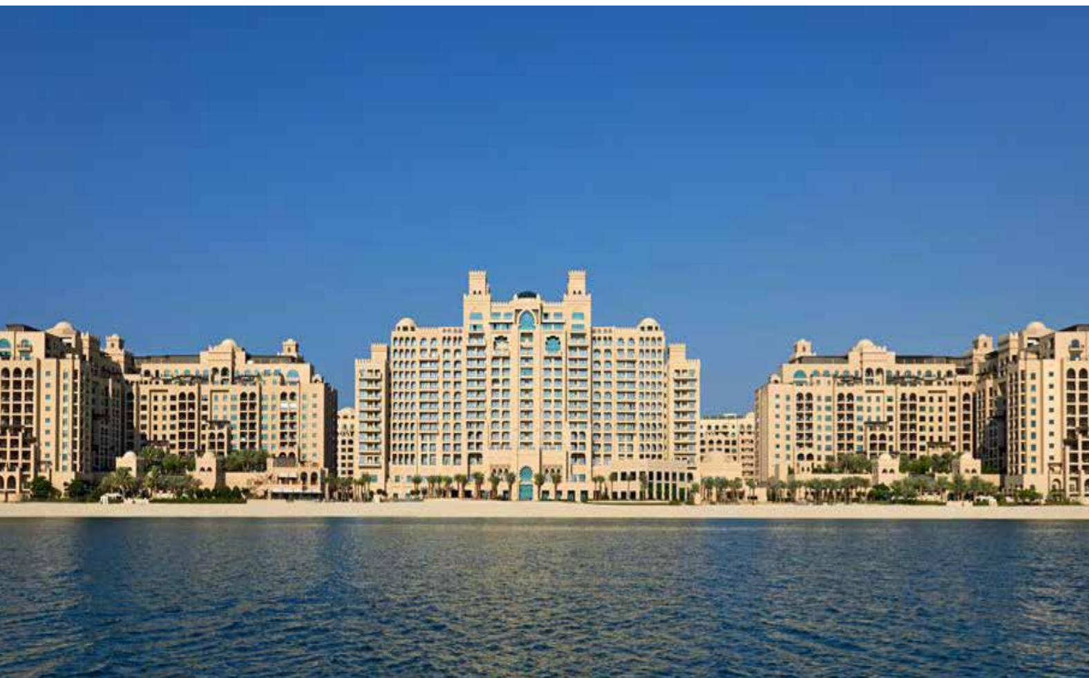
Fairmount Hotel Palm Island Dubai