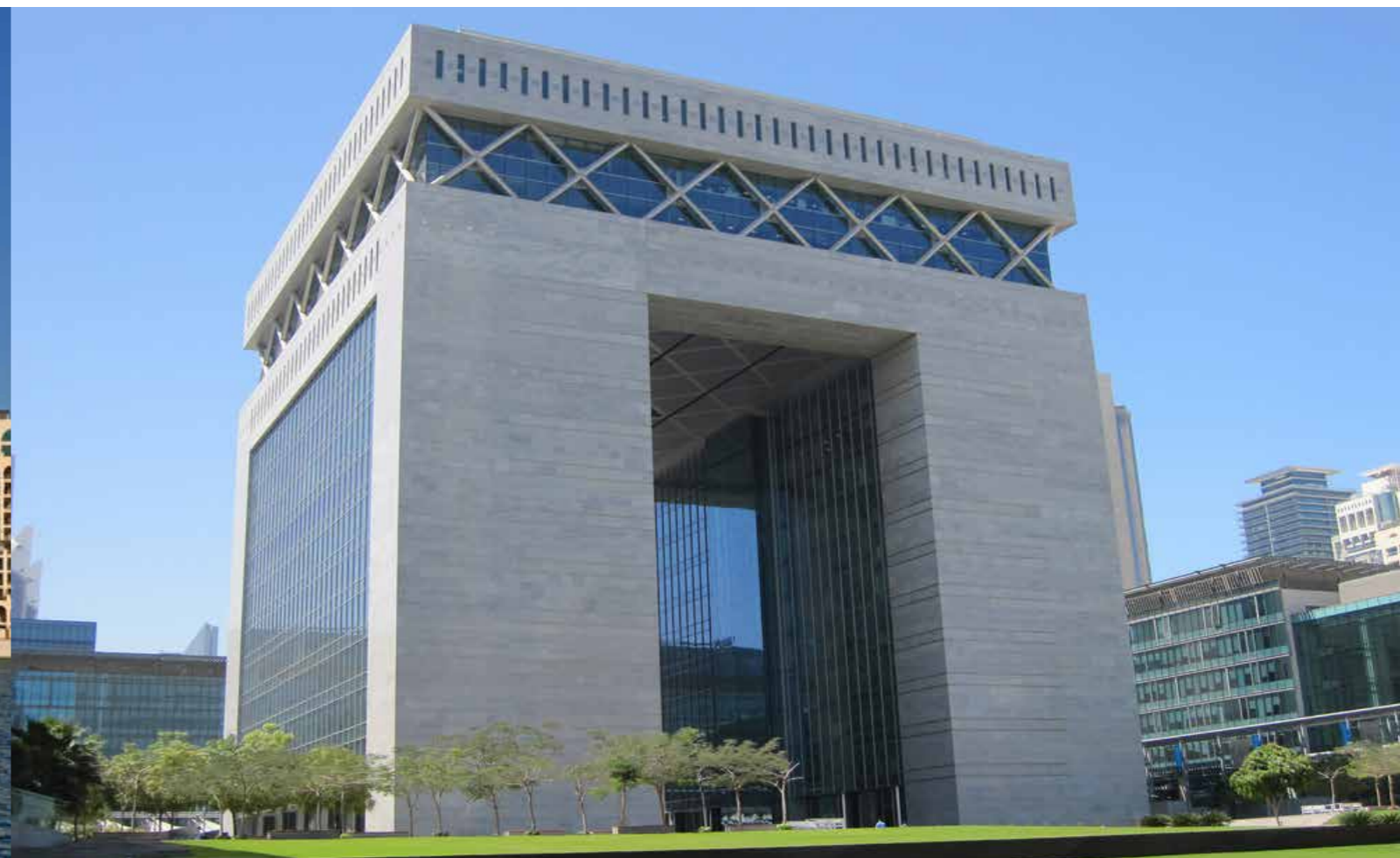
Financial District Gate Dubai