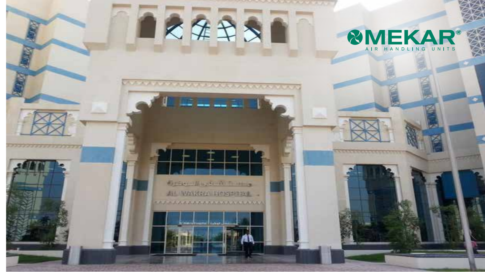
Al Wakra Hospital Qatar