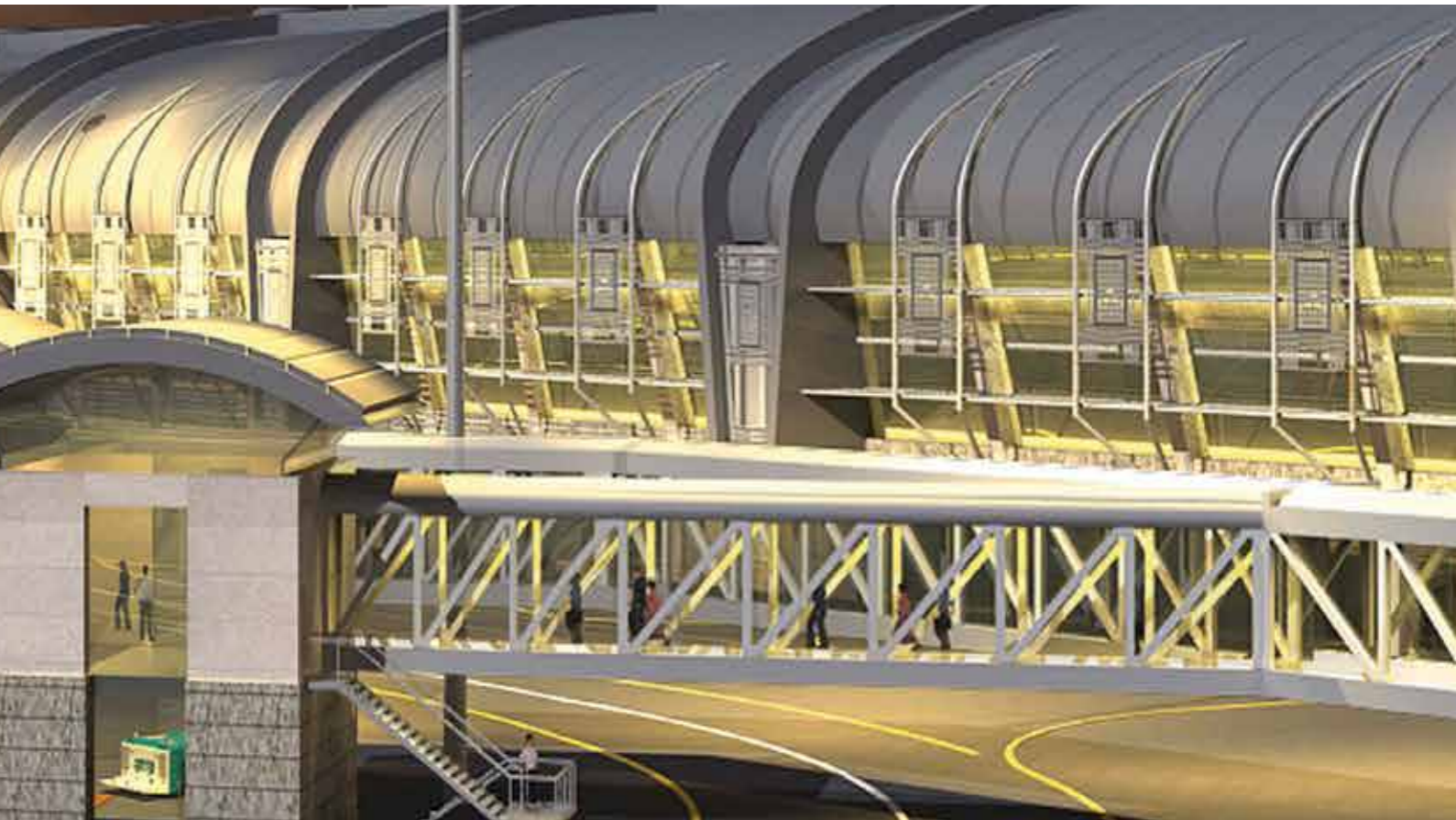
Oman Airport MC2