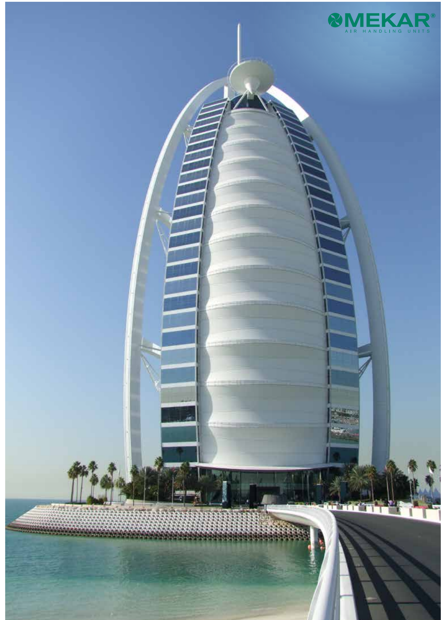
Burj Al Arab Dubai