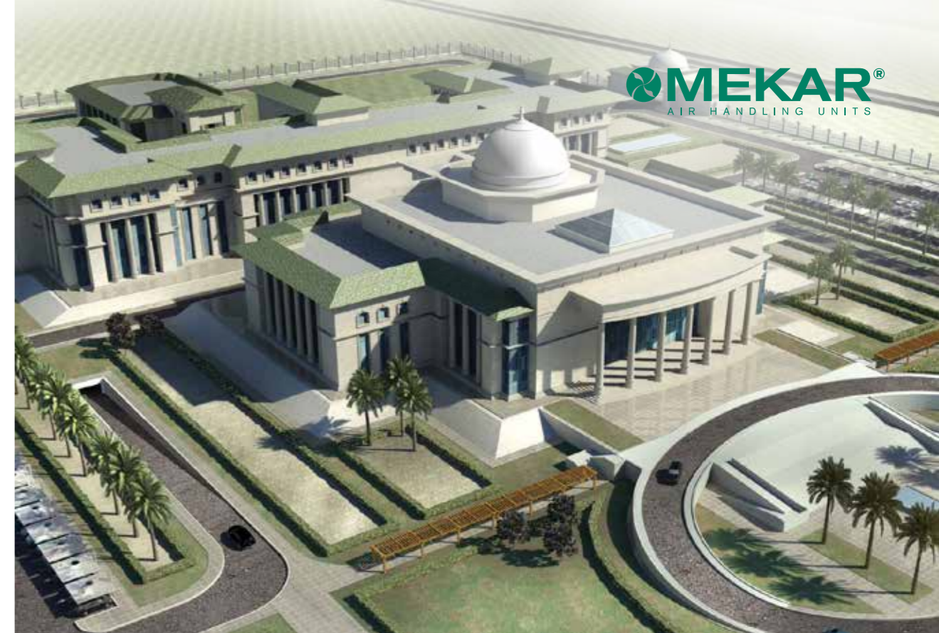
Ministry of Justice & Federal Courts Abu Dhabi