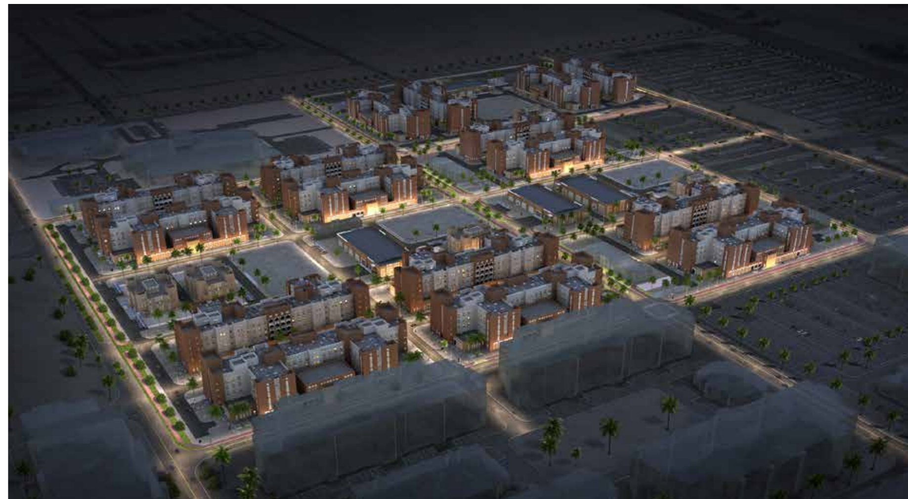
ISF Camp - Qatar