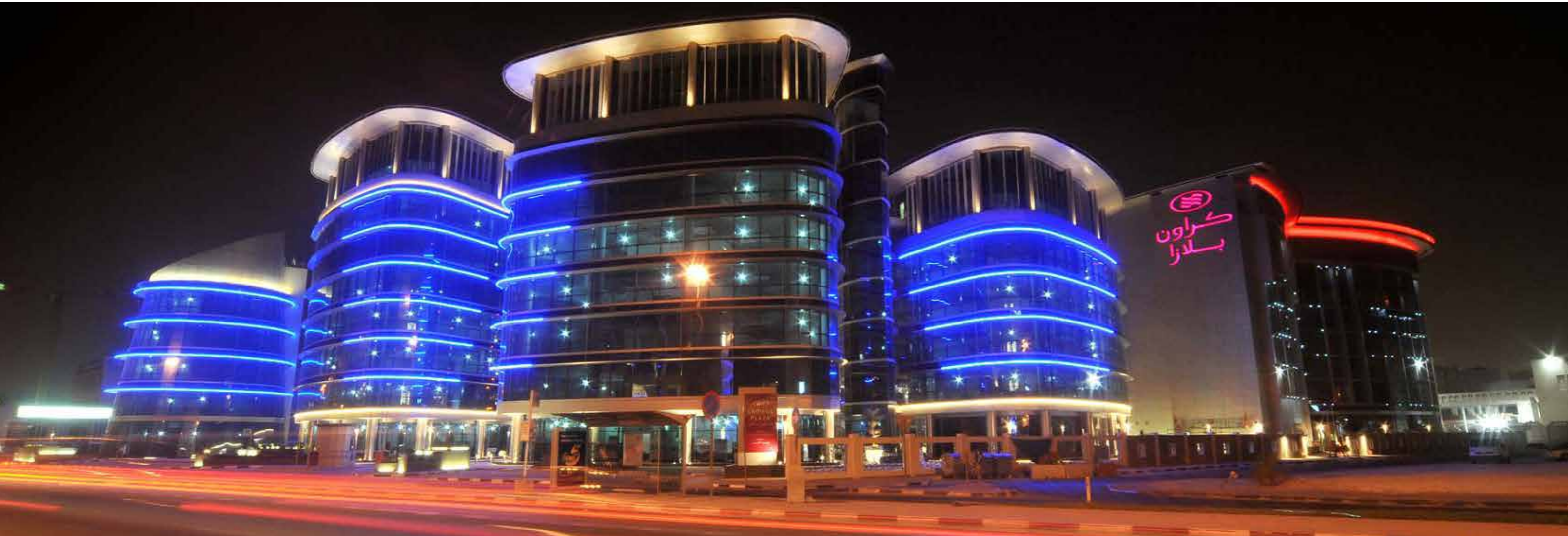
Crown Plaza Qatar