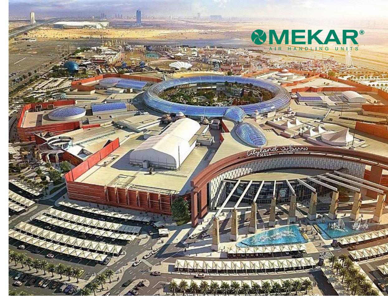
Cityland Mall Dubai