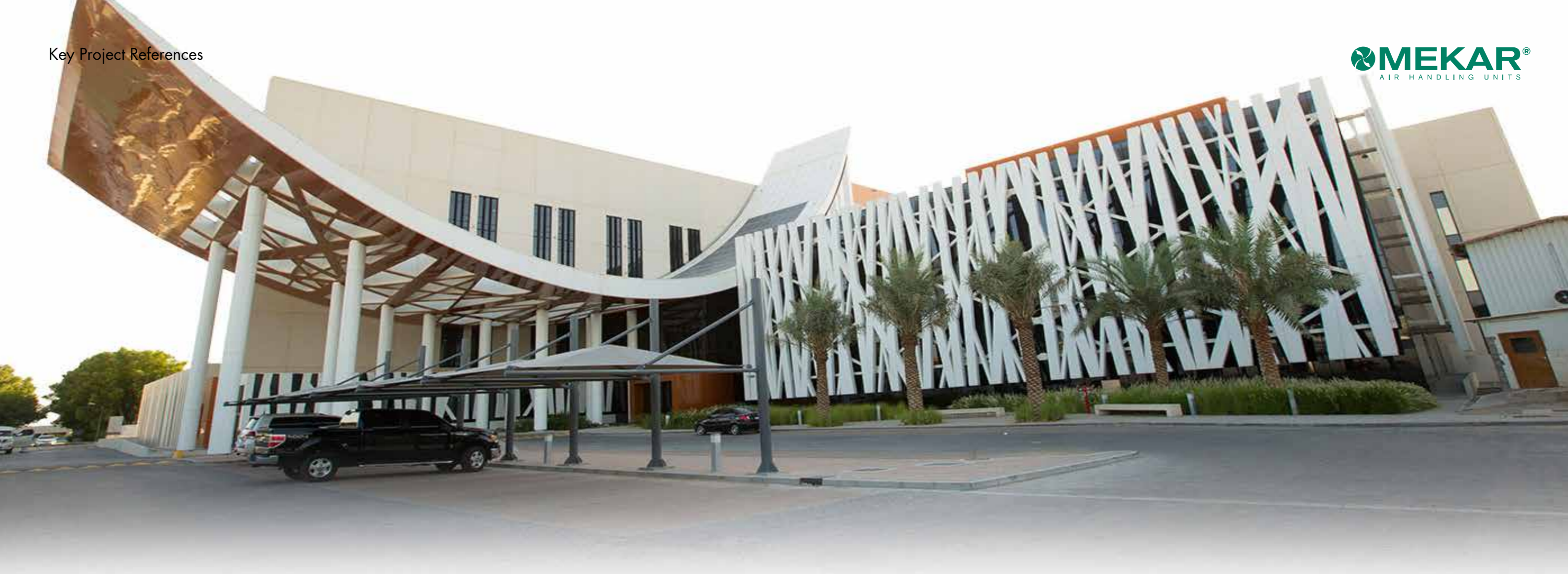
Oasis Hospitl Al Ain