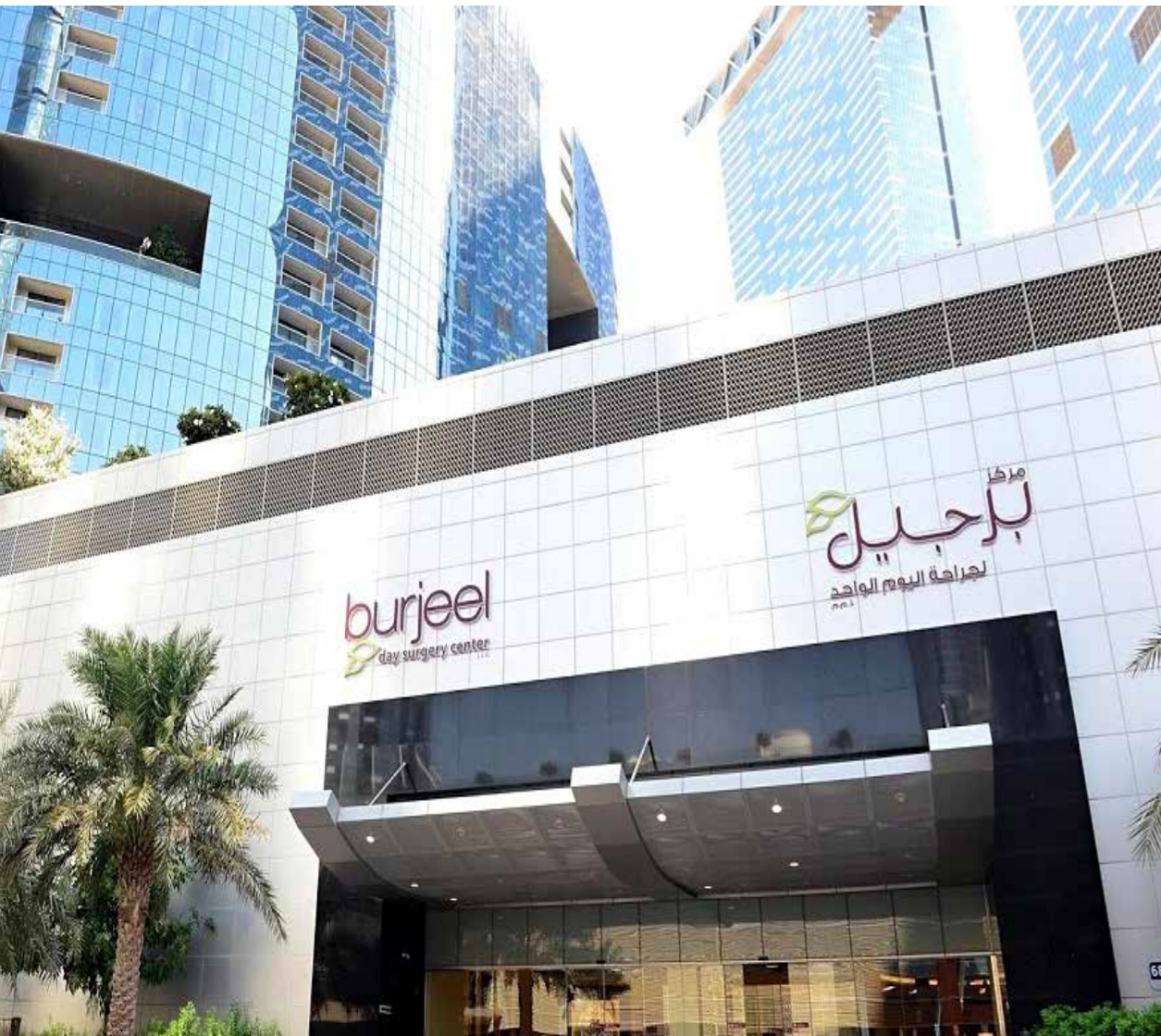
Burjeel Hospital - Reem Island Abu Dhabi