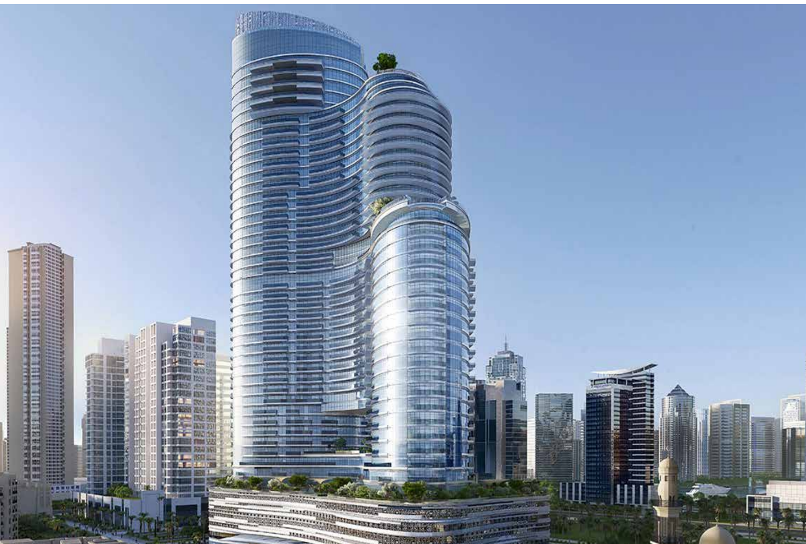
Imperial Avenue, Downtown Dubai