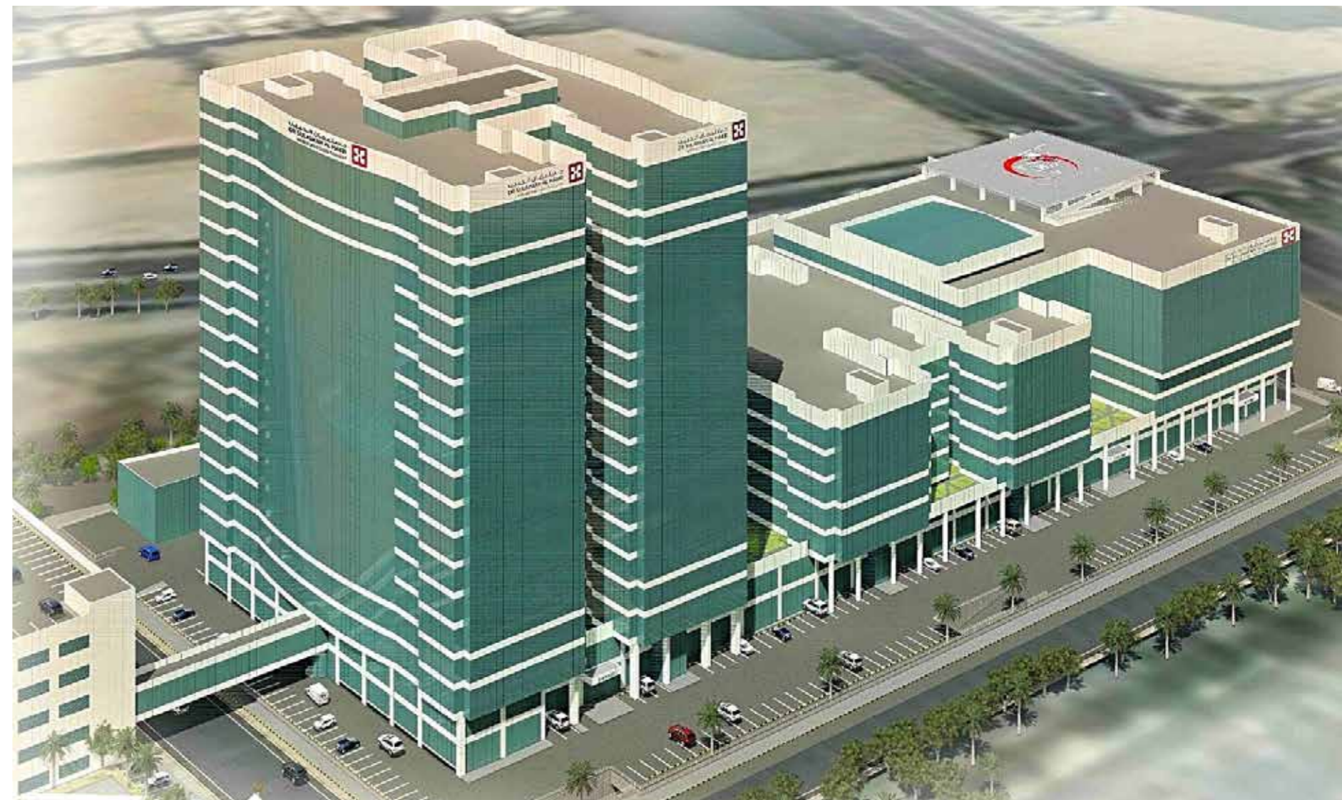
Dr. Sulaiman Hospital - KSA