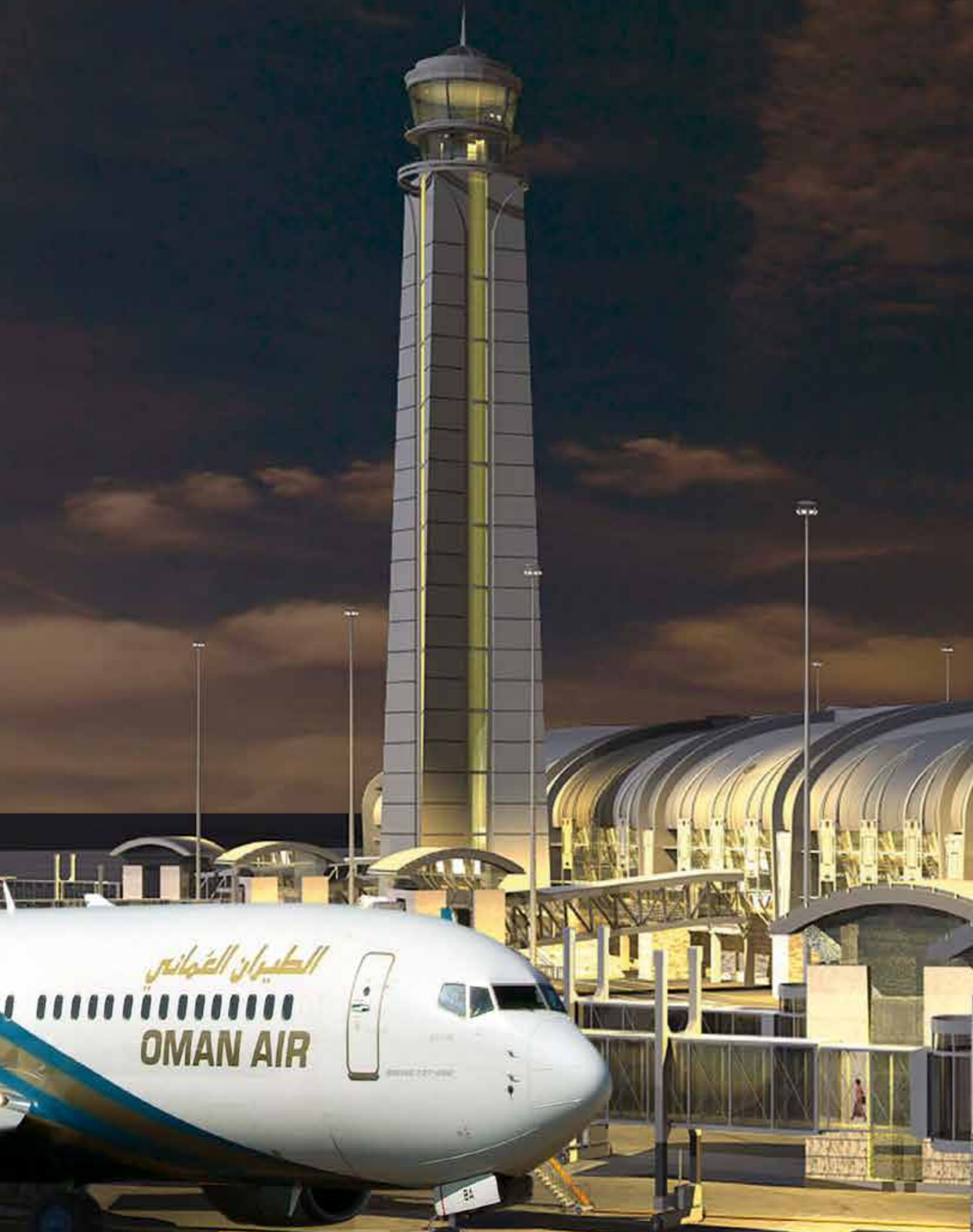
Oman Airport MC2