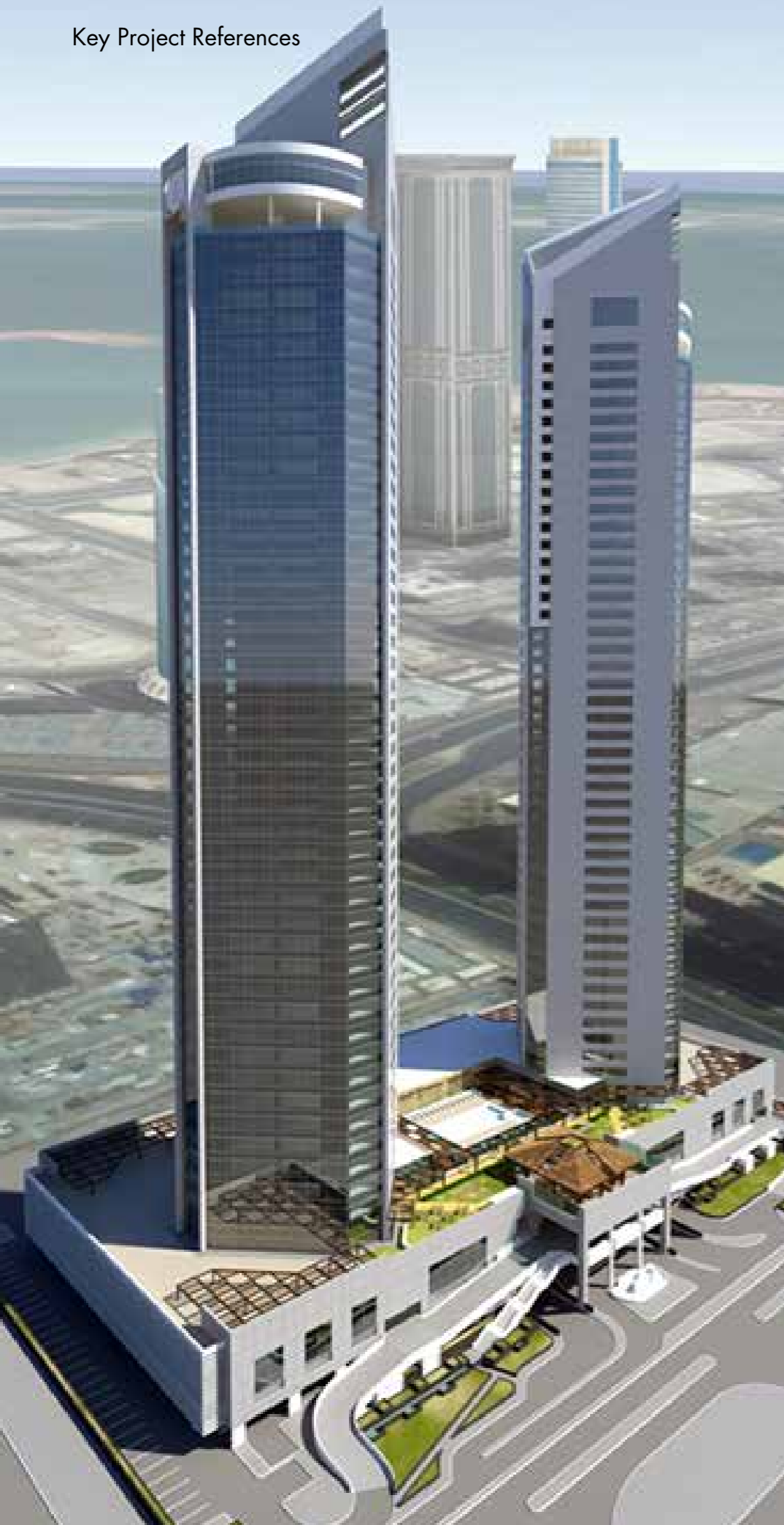
Twin Tower Qatar