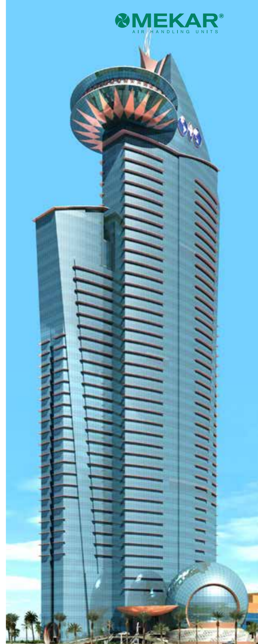
World Trade Center Qatar