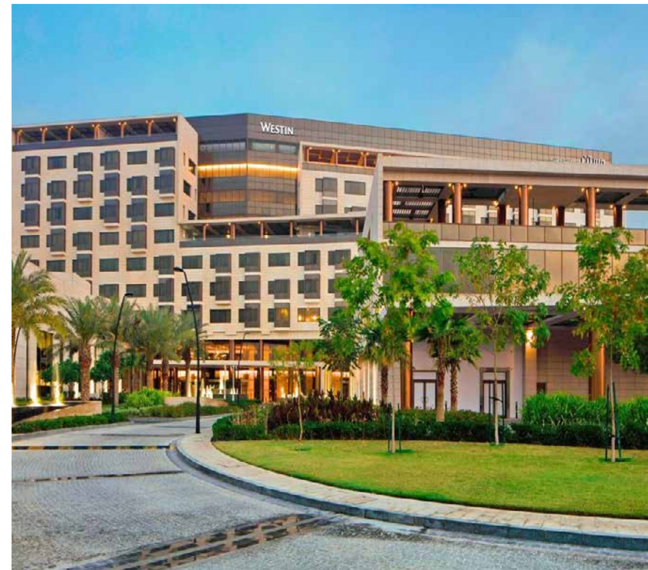
Westin Hotel – Doha