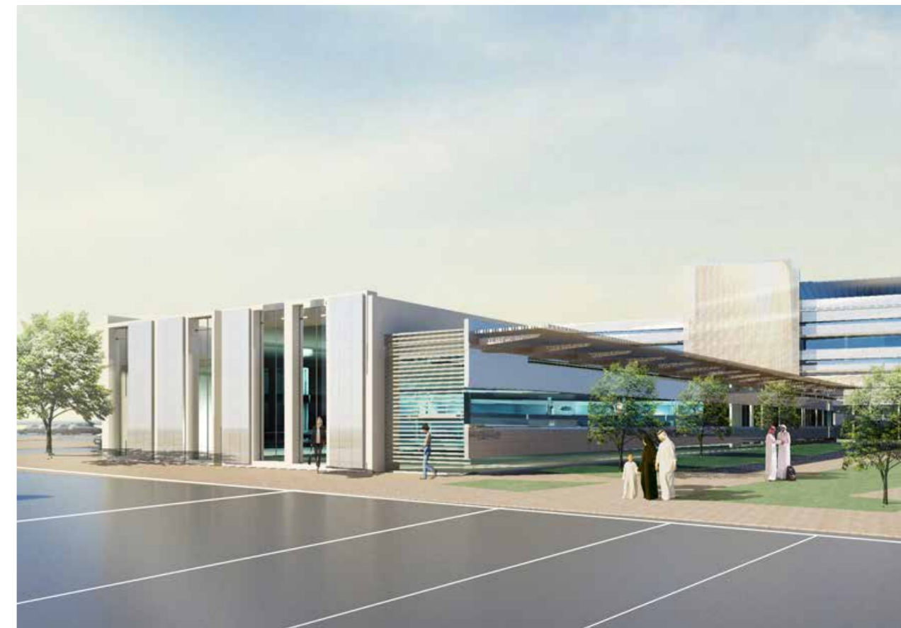
Al Sila Hospital Abu Dhabi