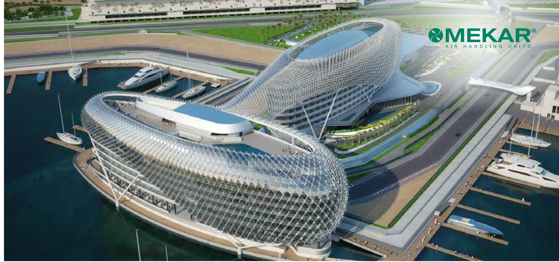
Yas Marina Hotel Abu Dhabi