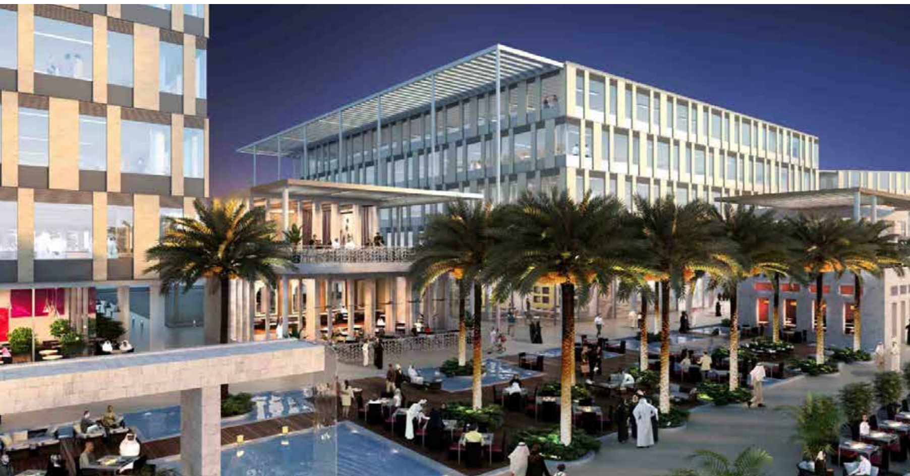
North Gate Mall Qatar