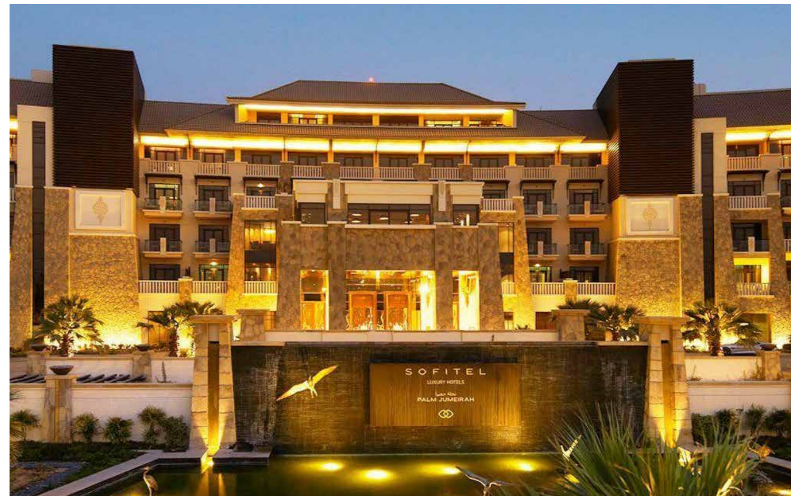
Sofitel Palm Jumeirah Dubai