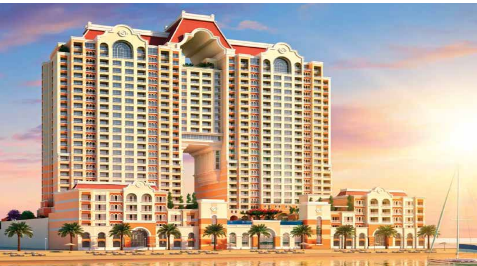
Al Mutahidah Tower Qatar