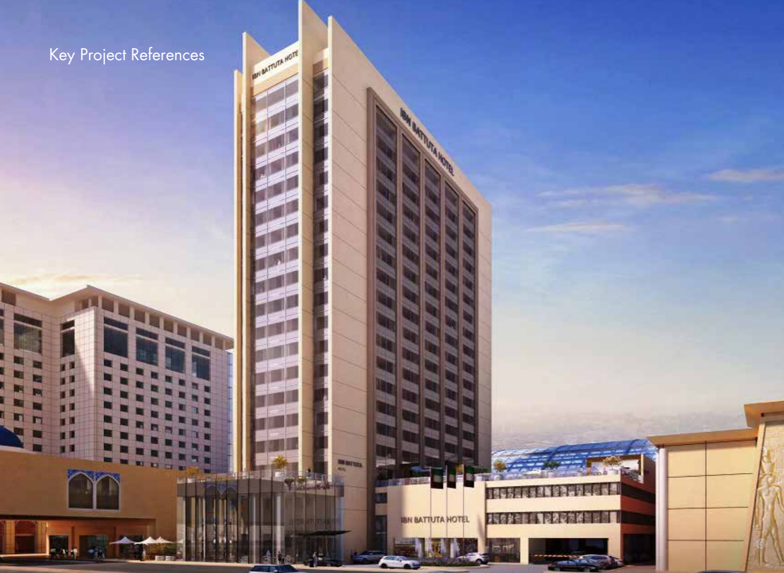
Avani Hotel, Ibn Battuta, Dubai