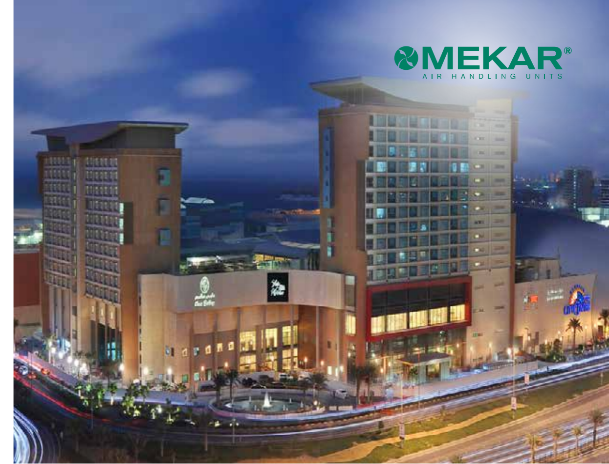
Bahrain City Centre