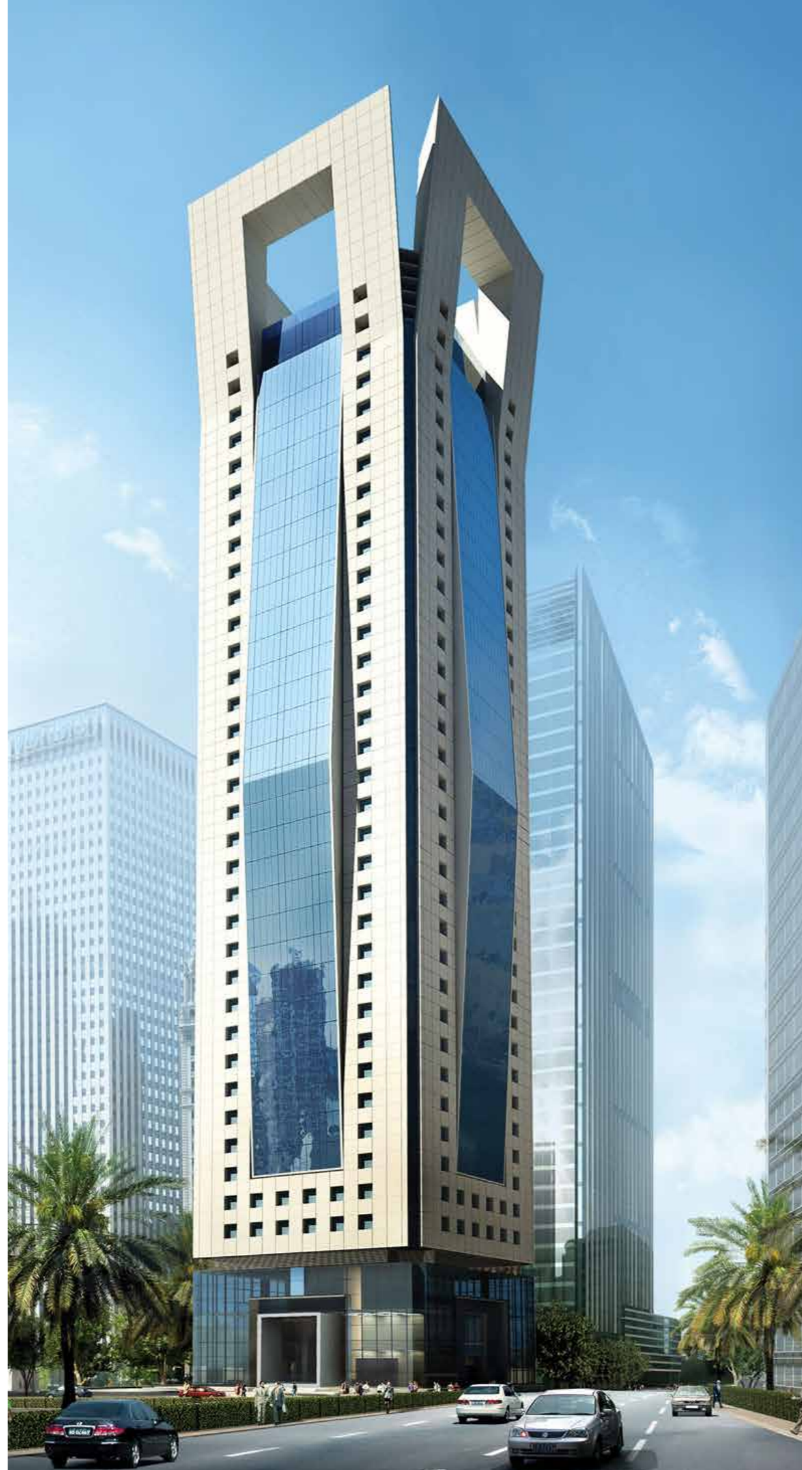
Al Thuraya Tower Qatar