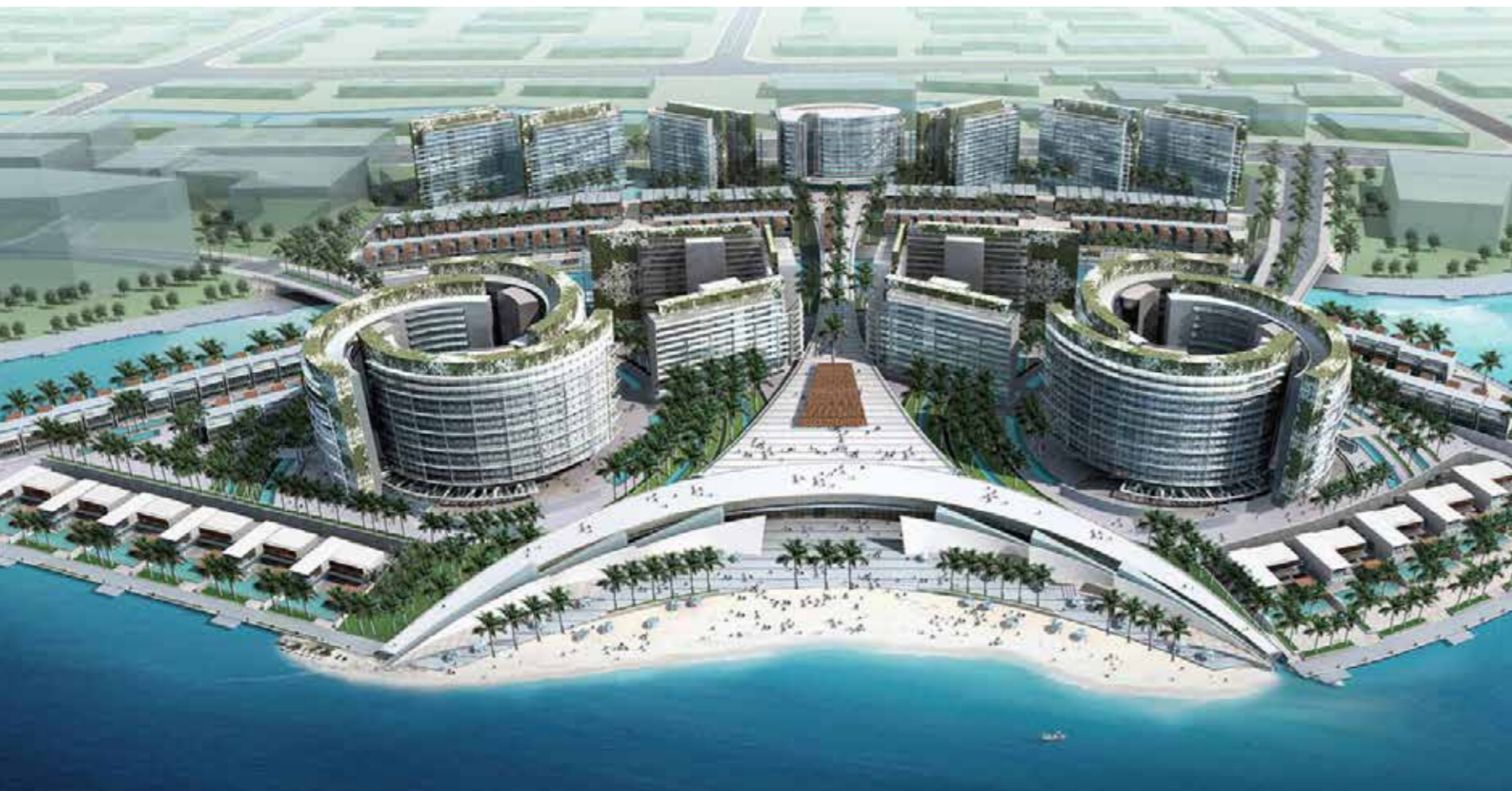
Al Muneera Abu Dhabi