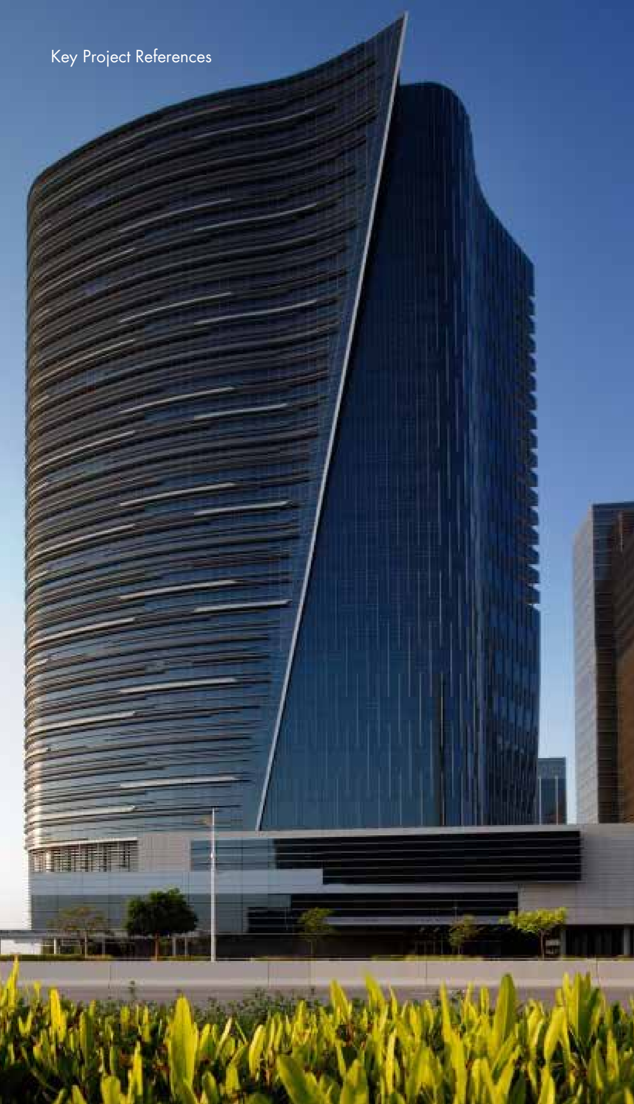
Rose Wood Hotel Abu Dhabi