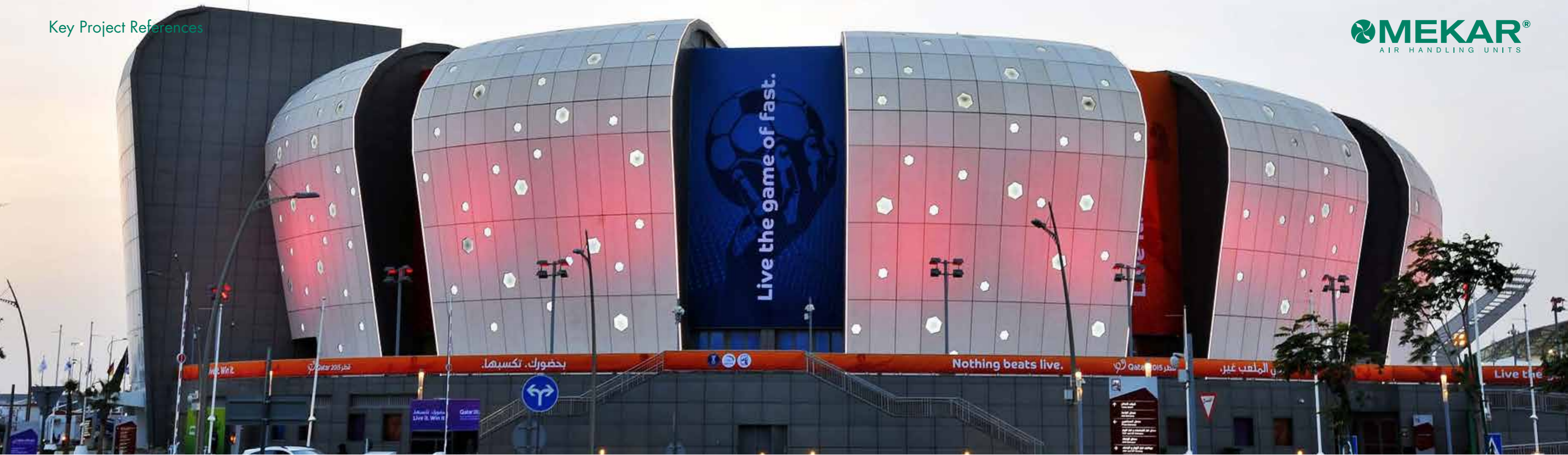
Handball Stadium Qatar